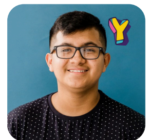
Summary Note Recording